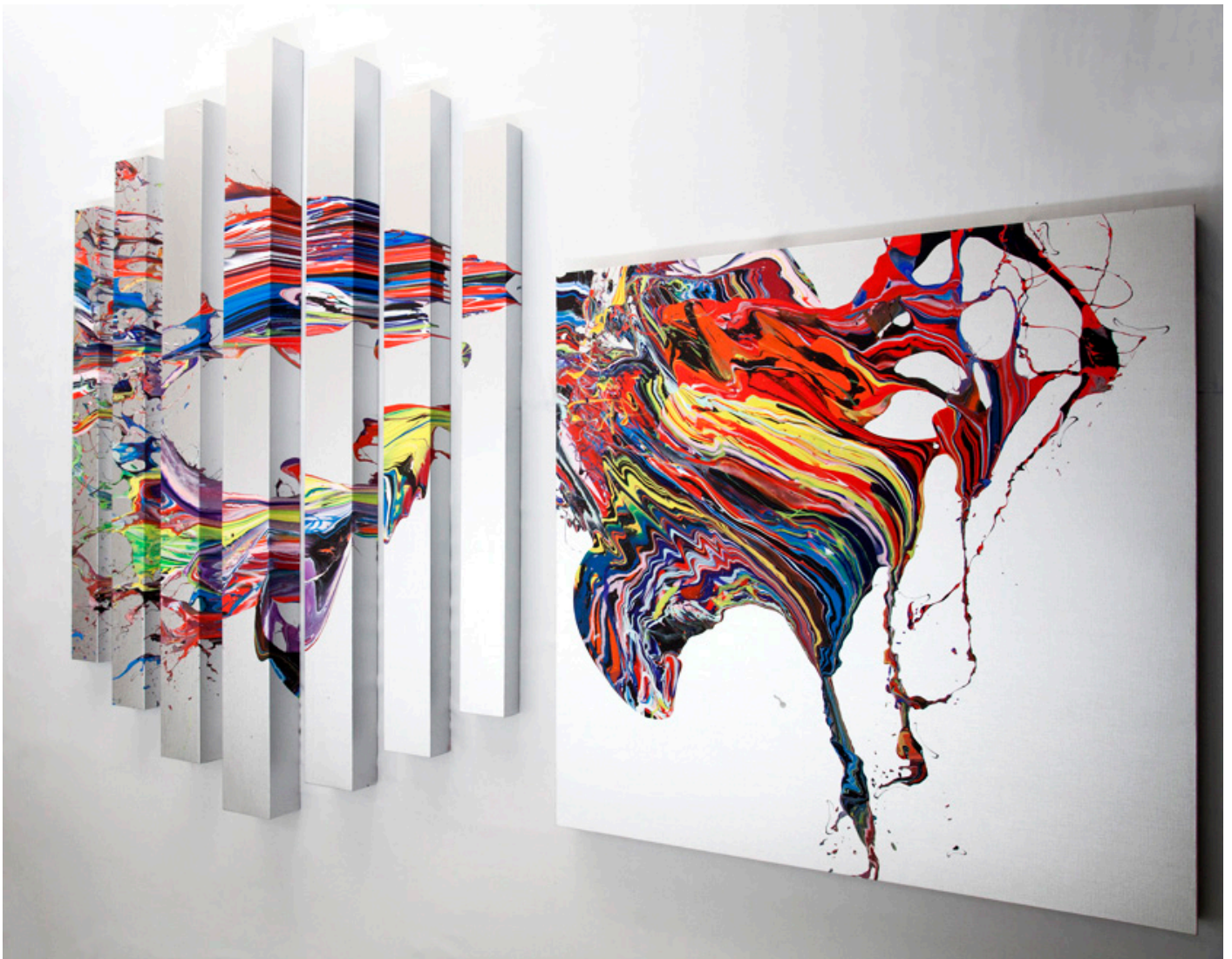
"Riding Awareness - Messenger Molecule" - installation - 370x250cm +14cm - 2013