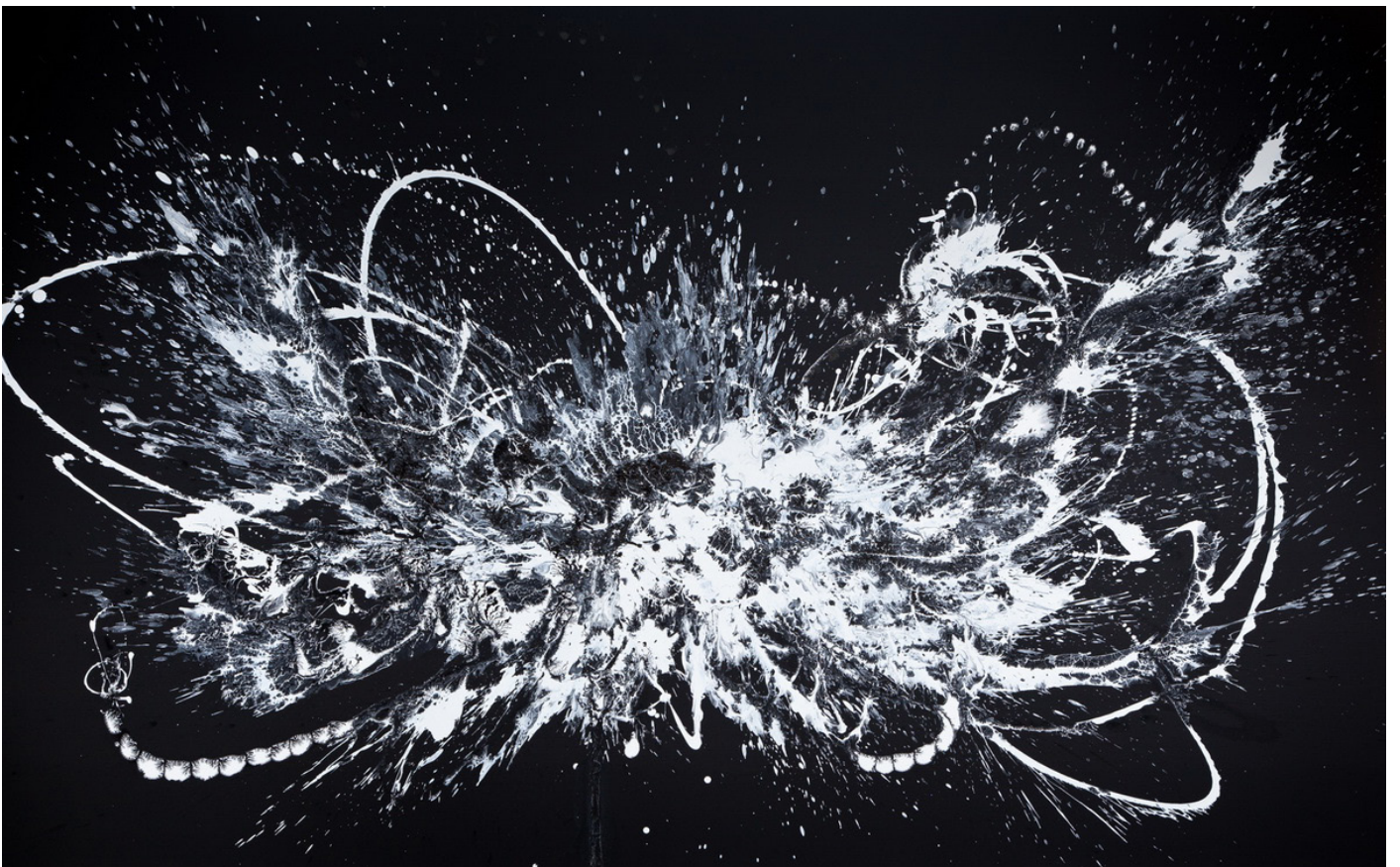
"Gene&Ethics Stardust Master" - acrylic on canvas - 270x170cm +10cm - 2012